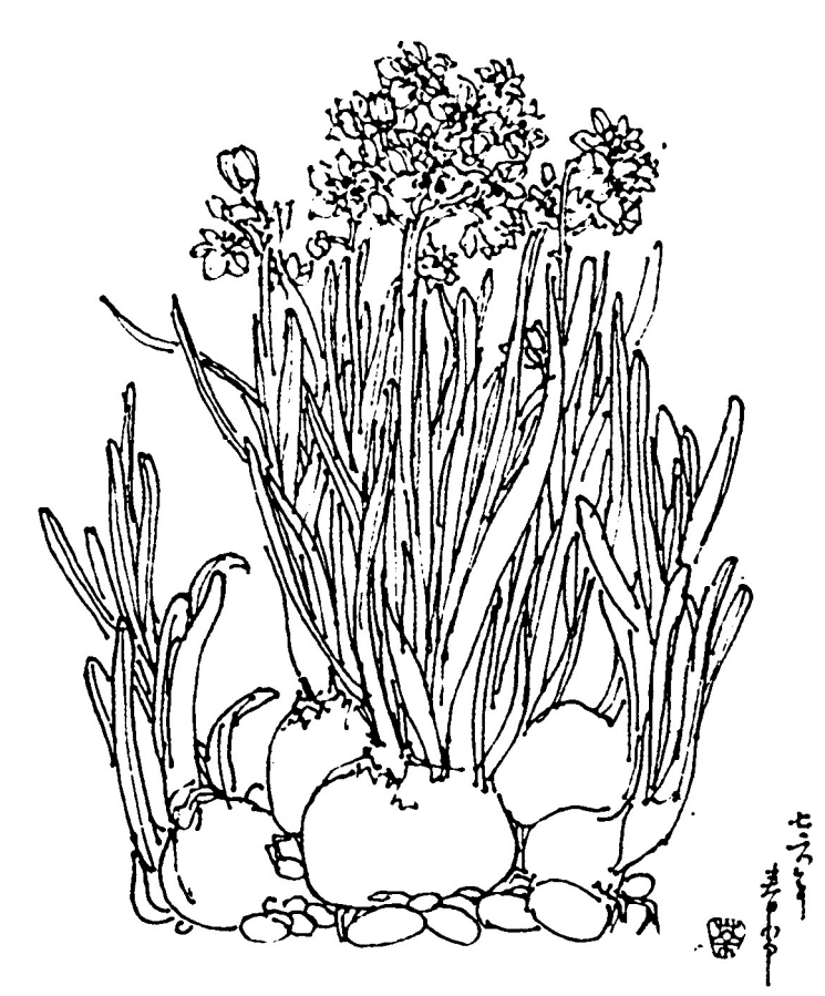
Plants. Drawing by Wu Guan Zhung. Shum Chun, China.